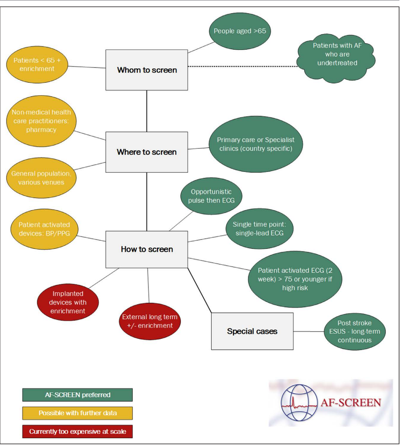
Figure 3. Diagrammatic representation of key points on screening.

Enrichment is the use of additional risk factors or biomarkers to either increase the proportion with unknown AF in the screened population or increase the risk of stroke in those with AF detected by screening in that population. Patients who are undertreated are patients with known AF who are not receiving oral anticoagulant according to guidelines. (see page 1859 section, Screening for Undertreated Known AF). Although this is not strictly speaking screening, such patients will be detected by population screening for AF, so this has been placed in a different shape with a dotted line connector. BP indicates blood pressure; ESUS, embolic stroke of uncertain source; and PPG, photoplethysmography.