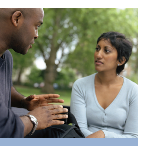
Share concerns with friends.