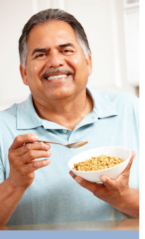
Make healthy food choices.